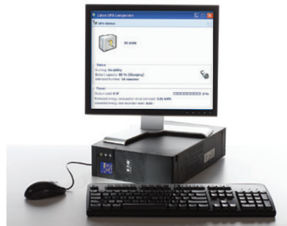
The 5S fits in small spaces and can also be used as a monitor stand.