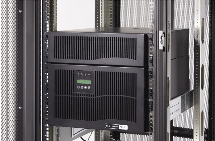
The Powerware 9140 UPS and one EBM occupy only 9U of rack space.