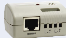
Environmental Monitoring Probe

Independently manage diverse servers. A Multi-server Card enables up to six serially connected devices of mixed operating systems to be independently managed and controlled by a single UPS.