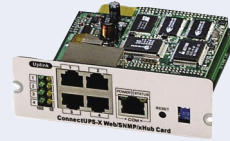
ConnectUPS Web/SNMP Card

The standard unit is equipped with USB and RS-232 serial ports to communicate with power management software. You can customize your UPS by adding an interface card for other applications: