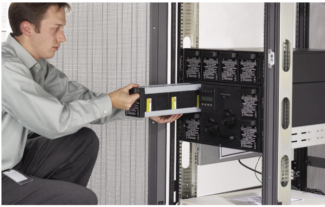
Modular, lightweight design allows for easy installation and service