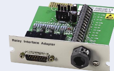
Relay Interface Card

Interwork with you existing Building Management System. A Modbus® Card enables real-time monitoring of UPS systems through a Building Management System or Industrial Automation System.